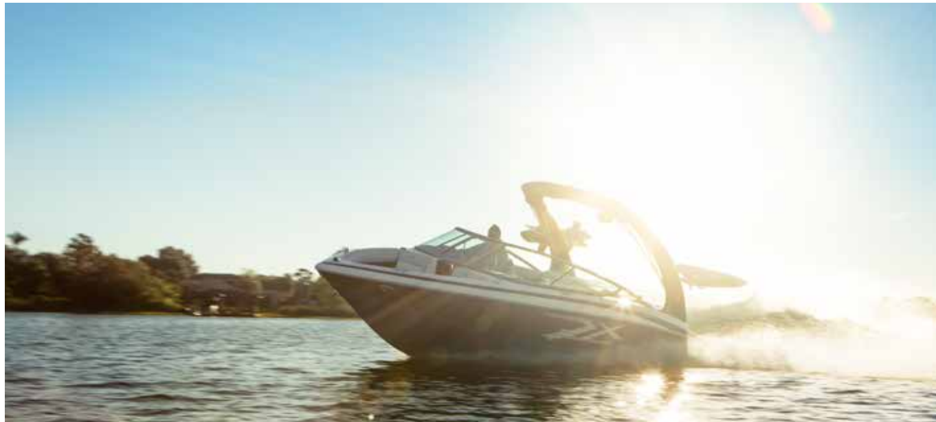
Available Engine Options with Forward Drive

One small leisure boat that can do it all? Volvo Penta Forward Drive makes it possible.